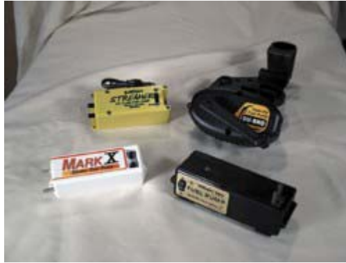
Du-Bro hand-refueling system (top right) mounts on fuel bottle holding glow igniter, spare plugs, glow wrench. Yellow Sullivan fuel pump mounts in field box with its own on-off/direction switch. Sonic-Tronics Mark X 12-volt pump uses power-panel switching. Black Thunder Tiger pump contains own 6-volt batteries.