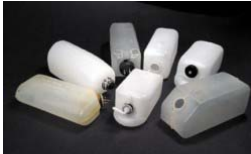
L-R: Narrow tank used vertically, flat-bottom tank for use over retract nose gear, high-pressure tank for pressurized fuel systems, standard sport square shape, square tank with "bumper" to protect fuel lines, popular space-saving "slant" tank. Center bumper tank comes with fittings installed.

The most basic piece of engine-support equipment is the onboard fuel tank. Without someplace to store fuel in the aircraft, flight times tend to be short. Fuel tanks designed for RC models are usually blow-molded using fuel-resistant synthetic materials—not metal. Metal fuel tanks are usually designed for and used in CL aircraft, although many CL modelers also use "plastic" tanks.