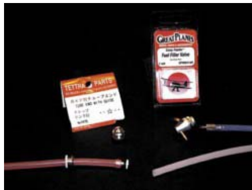
Whitish silicone fuel line is best used inside tanks. Pink Prather Products, blue Aero