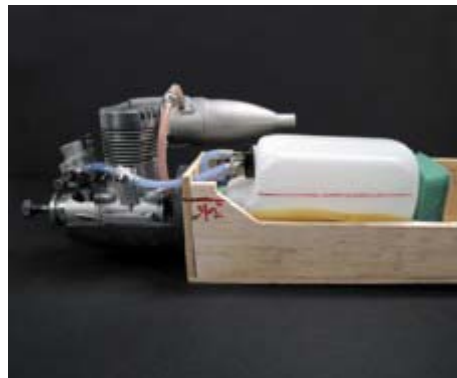
Tank's centerline is roughly 1/2 inch below fuel inlet. Usual way to get this height is

Today's RC fuel tanks come in many sizes, styles, shapes, and construction materials. A photo shows just a few of the options. Most trainer models use some form of 8- to 16-ounce square tank.