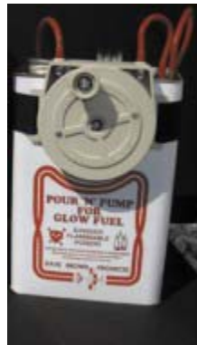
Dave Brown Products' Pour "N" Pump hand system contains only one moving part—the rotating handle—and own fuel container already plumbed.

The fuel line used to plumb the refueling system is usually the same reinforced silicone line used onboard the aircraft. Many electric-fuel-pump manufacturers recommend that the large fuel line be used to reduce wear on the pump. Sometimes that requires using a short length of medium fuel line over the filling nozzle and then applying the large line over the assembly.