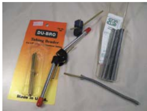
Du-Bro tool bends standard 1/8-inch-diameter tubing and includes four 3-inch tube sections. Blue Harry Higley tool works on 1/16- and 1/8-inch sizes. K&S system works on all sizes from 1/16 to 3/16 inch. All prevent kinks caused by hand bending.

For several years, my early refueling system was a 2-ounce turkey baster with a fuel tube attached. It was slow, but it worked! Such systems are still available, but in larger sizes, as shown. These squeeze bulbs are convenient backups if the primary refueling system fails at the field. You may want to include one in your field box just in case.