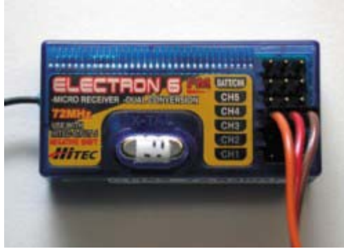
Cable from ESC plugs into throttle port on RC receiver. It doesn't look it, but connector is plugged into CH3 on this Hitec Electron 6 receiver.

Two more wires will have APP connectors attached, and they will plug into the battery pack. The third cable has a servo cable connector on the end. That cable is plugged into the throttle port (usually the number-three position) on your RC receiver. The switch will be mounted on the side of the fuselage and must be manually turned on to activate the entire electric power system.