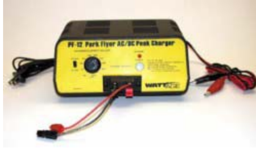
Global Hobby Distributors' WattAge PF-12 Park Flyer AC/DC Peak Charger. At left is 115VAC power input cable. At right is 12VDC power input cable. In front is pair of output wires with preinstalled APP connectors which attach to battery pack when it is being charged.

Motors: The electric motor itself is of primary importance. There are different types, such as simple ferrite magnet motors; the more sophisticated cobalt (samarium cobalt) magnet motors; and the highly efficient, long-lasting, expensive brushless motors.