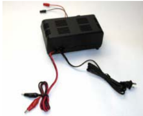
Rear of PF-12 showing 115VAC and 12VDC power input cables. This charger allows you to recharge battery packs indoors or at flying field from 12-volt car battery.

APP connectors have thoughtfully been attached to the two wire cables. As in the case of the motor connections, the polarity is critical to the system's correct operation. It is always positive to positive and negative to negative. If the color-code convention is followed, it is usually the usual red to red and black to black. However, not everyone uses that color convention.